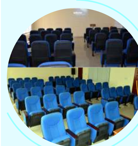
The 48-seater Mini Auditorium

Academy's facilities are open to hire by any government organisation, private establishment or professional body, for purposes of mini-conferences, seminars, workshops, business meetings, professional exams, promotion tests and aptitude tests.