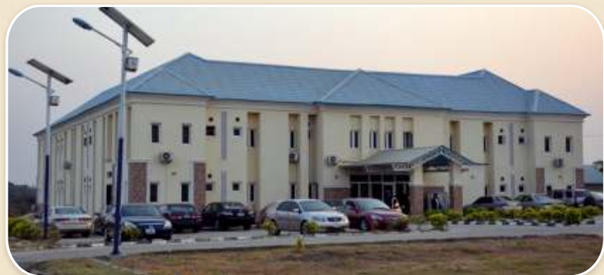
A 40-Room Guest House:- all en-suite

The Guest House is open for use by any organisation wishing to embark on a retreat or any other assignment which requires a serene environment.