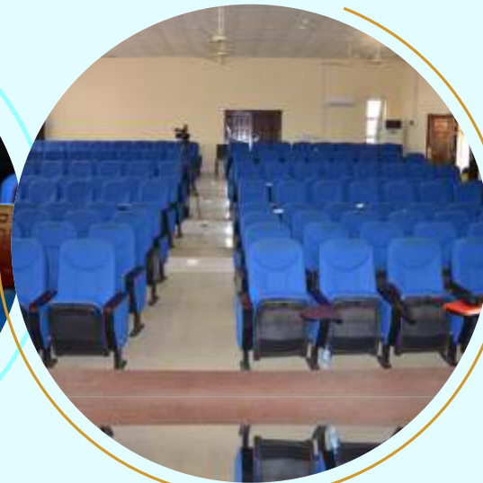
The 200-seater Main Auditorium at the Academy