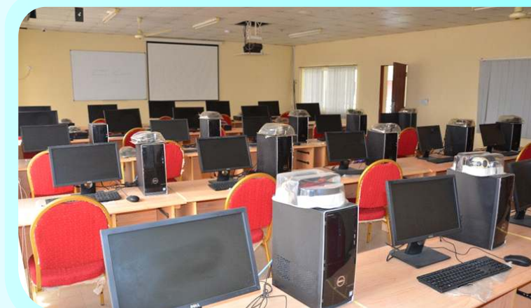
25-Seater Executive Classroom for Top Management Targeted Courses. There are three of such classrooms at the Academy. They are open for use by any organisation intending to host top management officials either in a seminar, workshop or business interaction

The Information and technology age has brought exciting new learning possibilities. The Academy has developed an online platform for e-delivery of the contents of courses to participants. It provides students and teachers with an effective means of interaction and for teaching and learning purposes. All the learning centres of the Academy are equipped with e-learning facilities including full multimedia learning systems.