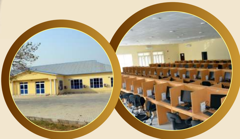
250 Capacity Computer Based Test Centre: open to any organisation wishing to conduct aptitude tests, promotion exams or any other form of test

The Academy houses a 250-capacity Computer Based Test facility. The facility is open for use by any organisation for purposes of recruitment aptitude tests, promotion exams and any other form of computer-based-test.