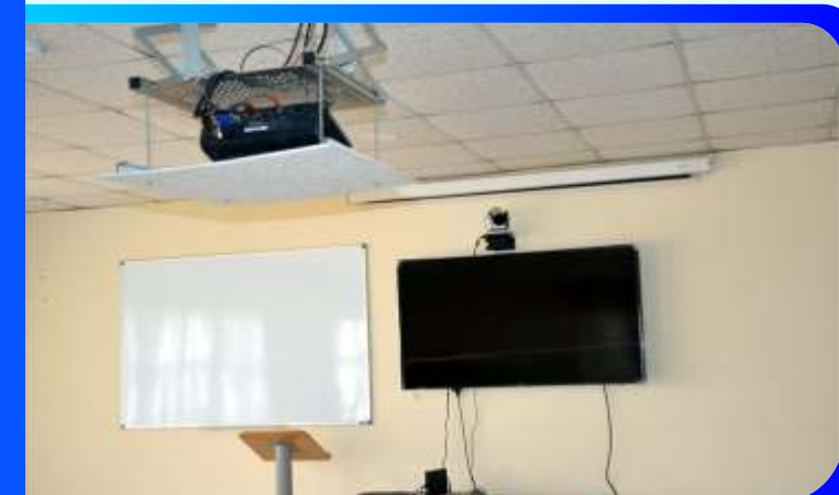
Facility for Teleconferencing