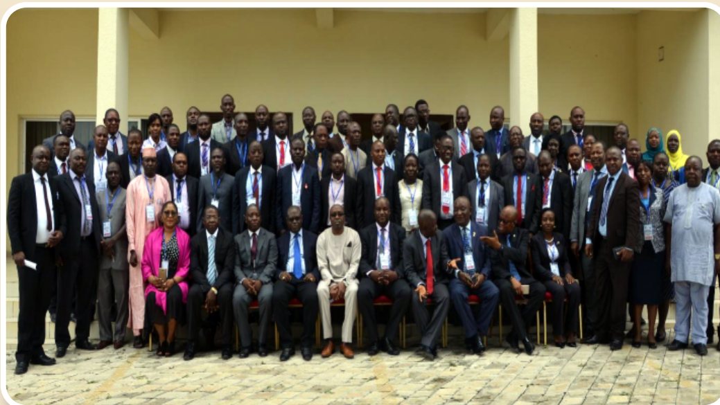
Participants at the training on Contemporary Issues on Asset Tracing, Recovery and Management for staff of Anti-Corruption Agencies held at the Academy from 12 - 14 September 2017.