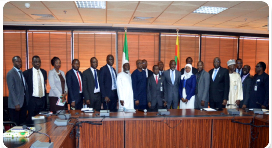
The Management of the Anti-Corruption Academy of Nigeria, ACAN and the Management of the Nigeria National Petroleum Corporation, NNPC in a Group Photograph during a courtesy visit to the Group Managing Director, NNPC on 17th March 2017