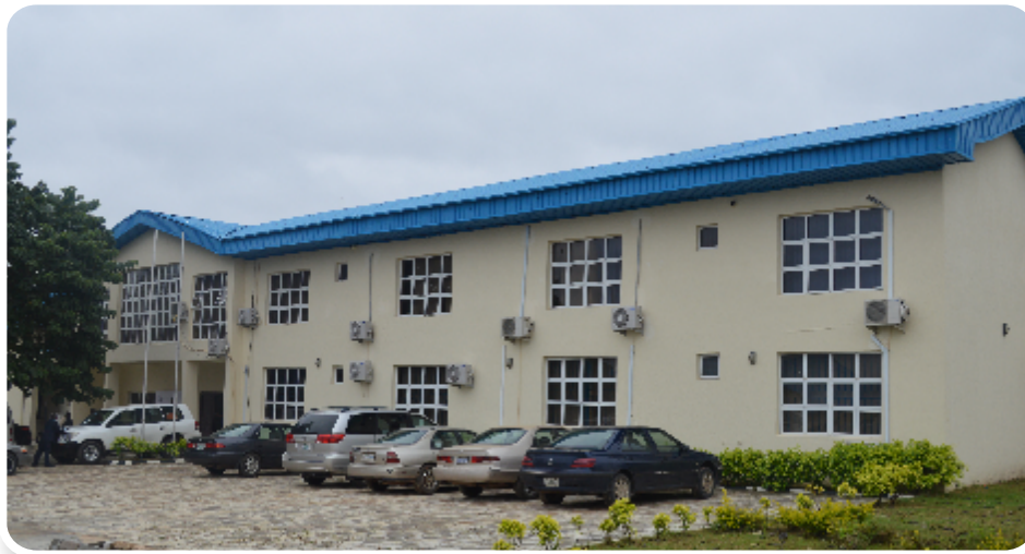
The Administrative building housing the auditorium and lecture rooms

Located in a serene environment in Keffi, Nasarawa State, 46 Kilometers from Abuja city centre, the Anti-Corruption Academy of Nigeria (ACAN) commenced activities in November 2014.