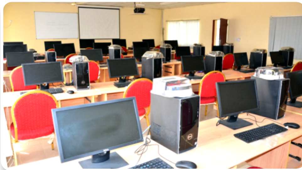
25-seater Executive Classroom for courses targeted at top management. There are three of such classrooms at the Academy.