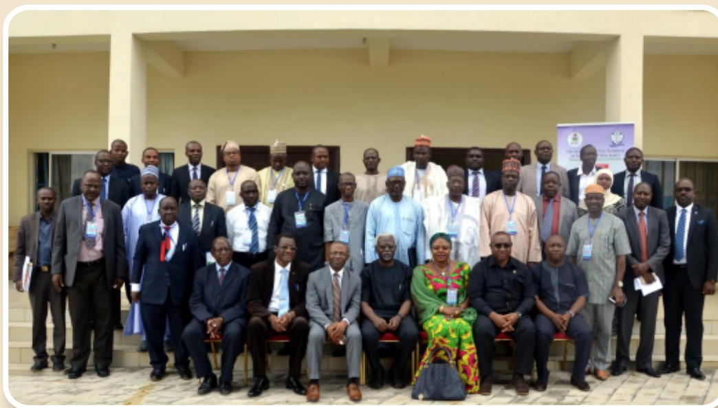
The first set of participants at the Anti-Corruption and Fraud Prevention training for State Government Officials , held from 13 – 15 June 2017 with the Chairman, ICPC; Secretary, ICPC and the Auditor-General of the Federation after the Opening Formalities on 13 June 2017.