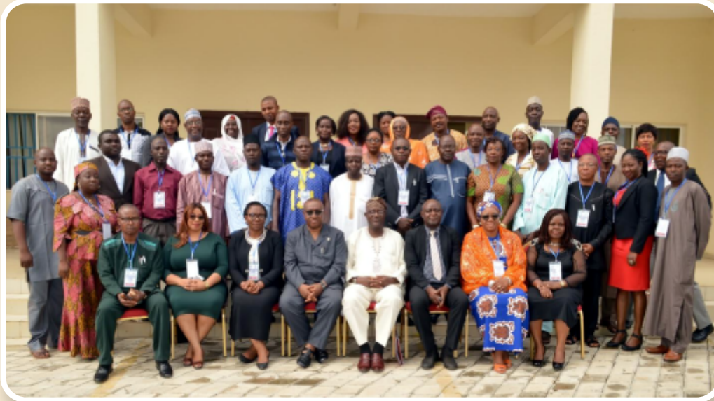
Participants at the Training on Investigative Skills Development , a bespoke programme for officials of National Broadcasting Commission, held at the Academy from 20 – 22 June 2017.