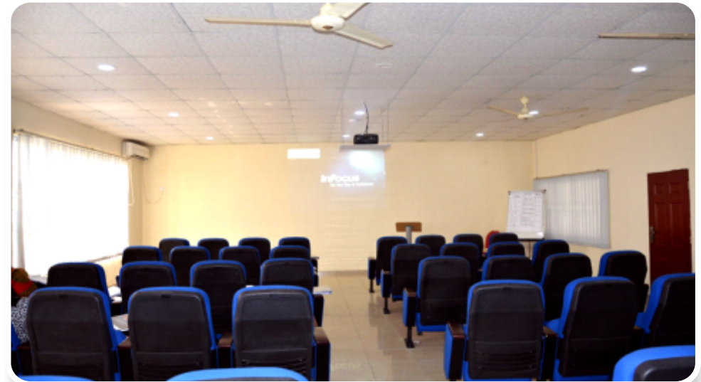
Cross-section of the 48-seater Mini Auditorium at the Academy

The Academy's activities are conducted from its Keffi premises which houses a Central Administrative block that provide staff offices, lecture rooms and auditoria equipped with multimedia projection systems. In addition to the 200-seater main auditorium is a 48-seater auditorium suitable for mini-conferences, seminars and workshops. The lecture rooms include three 25-seater and a 250-seater e-learning centres equipped with state-of-the-art computer systems and multimedia projection systems. The Academy also boasts of video conference room.