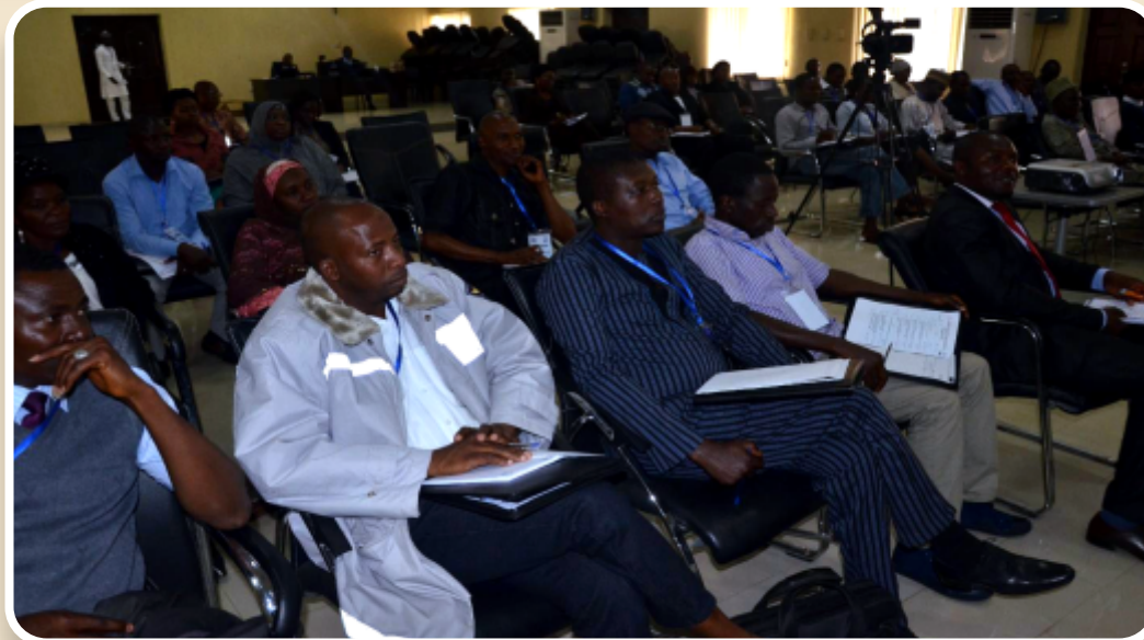
A cross-section of participants at the bespoke training for officials of Nigeria Institute of Mining and Geosciences, Jos, Plateau State, held in the Institute's Auditorium from 28–29 August 2017.