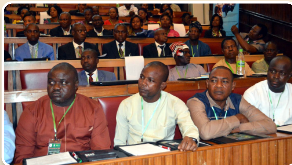
A cross-section of officials of Ebonyi State Local Government Councils during a training on Anti-Corruption, Ethics and Integrity , organised by ACAN in collaboration with FTA at the ICPC Headquarters, Abuja from 10 – 12 October 2017.