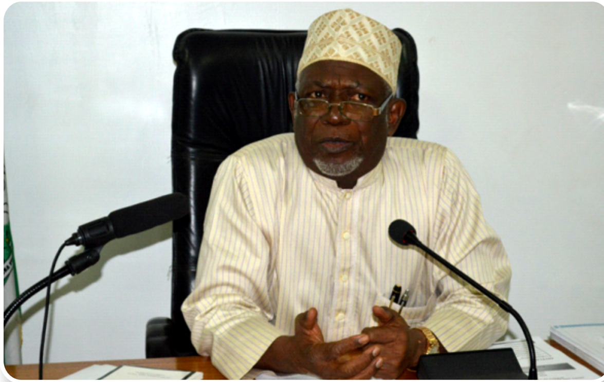
Ag. ICPC Chairman, Barr. Bako Abdullahi

With this move, Nigeria has taken its place among the nations that have shown seriousness to tackle corruption under the AUCPACC and UNCAC initiatives. When these Conventions came into force in 2003 and 2005 respectively, they were the first legally binding regional and global anti-corruption instruments, clearly defining corruption in its various forms and setting templates to deal with them through constitutional and legal methods. The Conventions required signatory nations to implement a wide range of measures in areas such as law enforcement, asset recovery, mobilization of stakeholders and international co-operation, for the overall success of the national and global anti-corruption campaign.