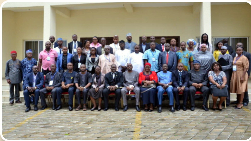
A cross-section of the first set of participants at the training on Achieving Project and Procurement Objectives with Integrity held at the Academy from 22–23 August 2017.