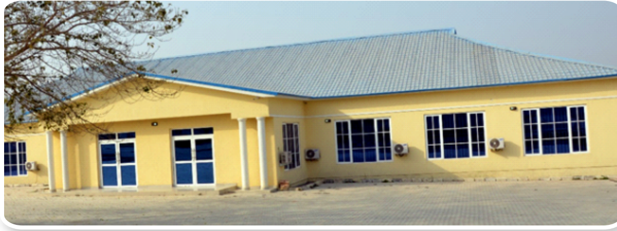
ICT Centre in the Academy for ICT Learning

of skills necessary for tackling corruption nationally and internationally. The Academy which is to serve as a platform for regular scholarly exchange in the field of anti-corruption studies and leading public opinion, will engage in efficient and widespread dissemination of anti-corruption resources and literature nationally and internationally.