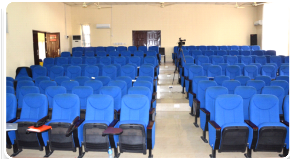
The 200-seater Main Auditorium at the Academy