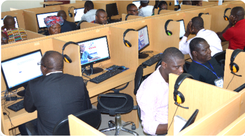
▶ One of the e-learning classrooms at the Academy in session

ACAN has been a centre for the Unified Tertiary Matriculations Examinations (UTME) since 2015