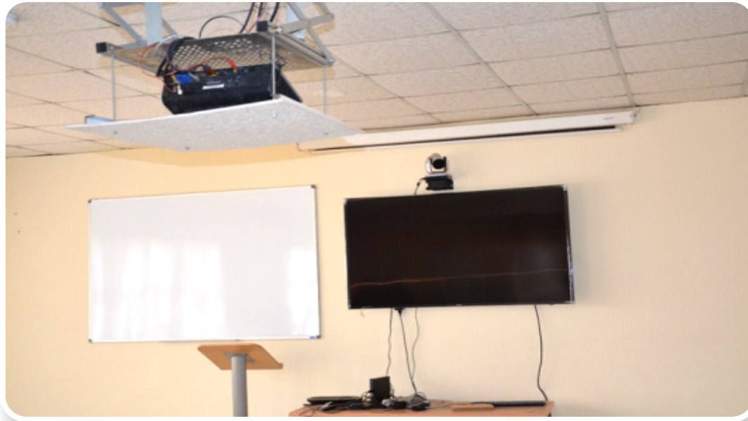
Facility for Teleconferencing