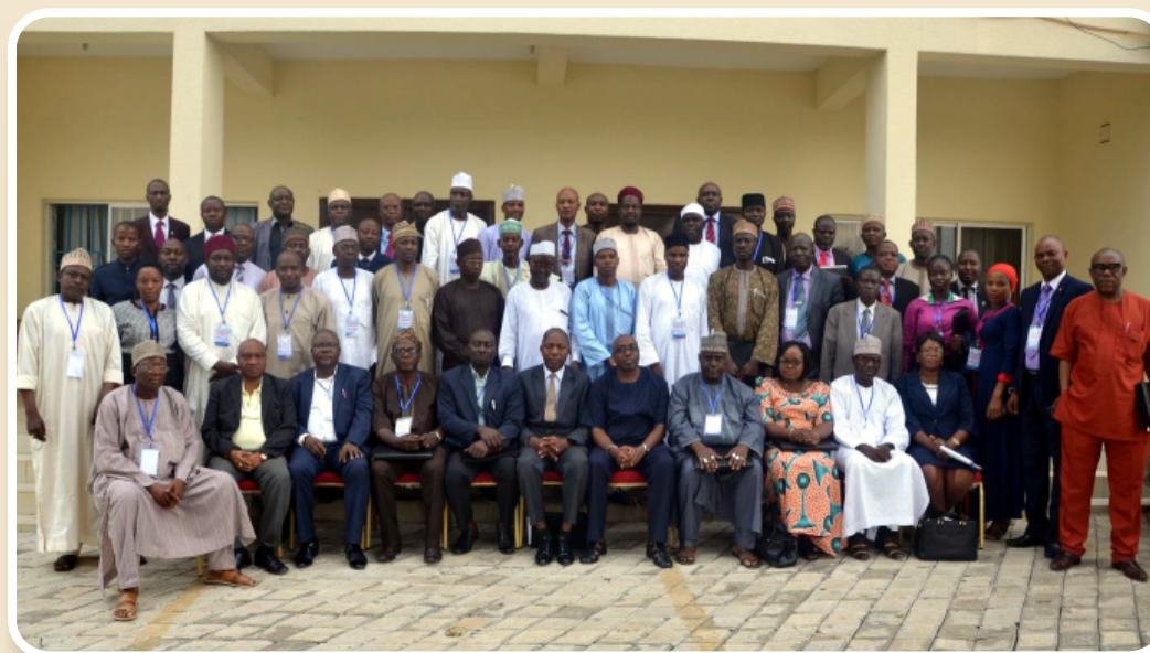
Participants at the second set of the Anti-Corruption and Fraud Prevention Training for State Government Officials , held at the Academy, 20 – 22 June 2017 with the Provost of the Academy.