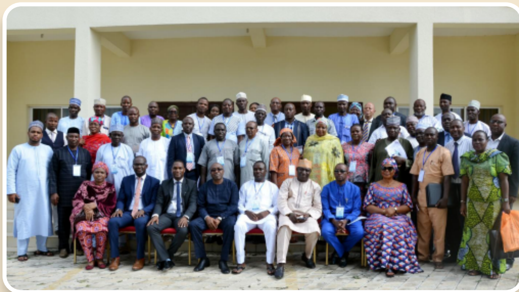
A cross-section of the second set of participants at the training on Achieving Project and Procurement Objectives with Integrity held at the Academy from 19 – 20 September 2017.