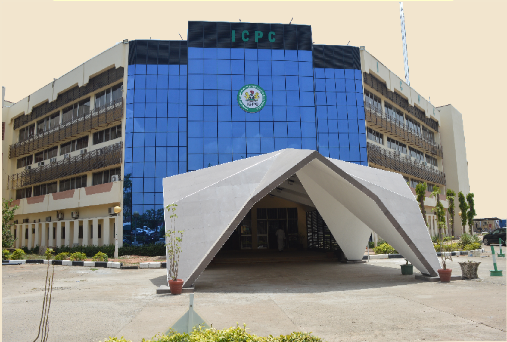
ICPC Headquarters, Abuja